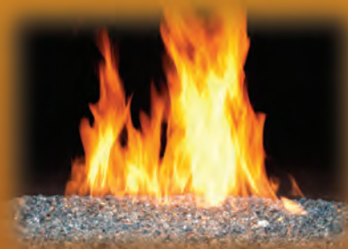
H-TUBE BURNER WITH REFLECTIVE BLUE GLASS

H-Tube Burners are available in 18", 24", 30" and 36" lengths. Offered as a burner kit that includes the burner, sand, volcanic rock, flex connector and fittings. Burner comes with fittings for Natural Gas. Available as match light only.