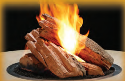
DROP-IN STYLE FIRE PIT BURNER WITH 20" WILDERNESS SPLIT LOG STACK

Drop-In Style Fire Pit Burner is available in a 22" diameter as a kit that includes the burner, valve, fittings, and connectors. Burner comes with orifices for Natural Gas and Liquid Propane. Available as match light only.