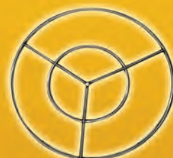
FIRE RING BURNER

Fire Wheels are available in 18", 24" and 30" diameters and Fire Rings in 36" diameter. Offered as a burner only or as a kit that includes the burner, valve, fittings, connectors and volcanic rock. Burner comes with orifices for Natural Gas and Liquid Propane. Available as match light only. (30" Wilderness log sets on the front of the brochure are shown with 30" Fire Wheel burner.)