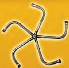
FIRE WHEEL BURNER

Fire Wheels are available in 18", 24" and 30" diameters and Fire Rings in 36" diameter. Offered as a burner only or as a kit that includes the burner, valve, fittings, connectors and volcanic rock. Burner comes with orifices for Natural Gas and Liquid Propane. Available as match light only. (30" Wilderness log sets on the front of the brochure are shown with 30" Fire Wheel burner.)