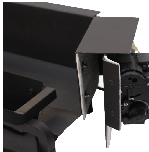
Valve Mount Close-Up