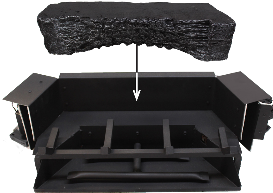
Stealth Burner Fiber Riser Log Placement

The Stealth Burner features a unique fiber riser that simultaneously adds protection to the valve components and promotes glow and Radiant Heat into the home.