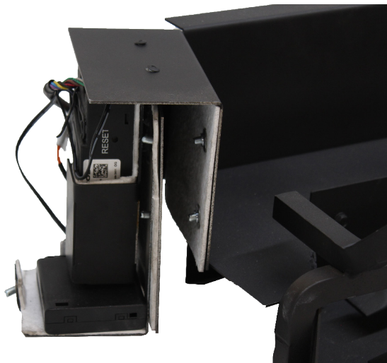
Module Mount Close-Up