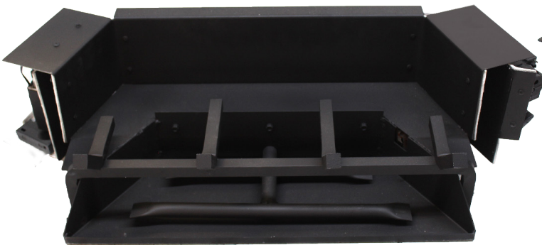
Natural Gas Version