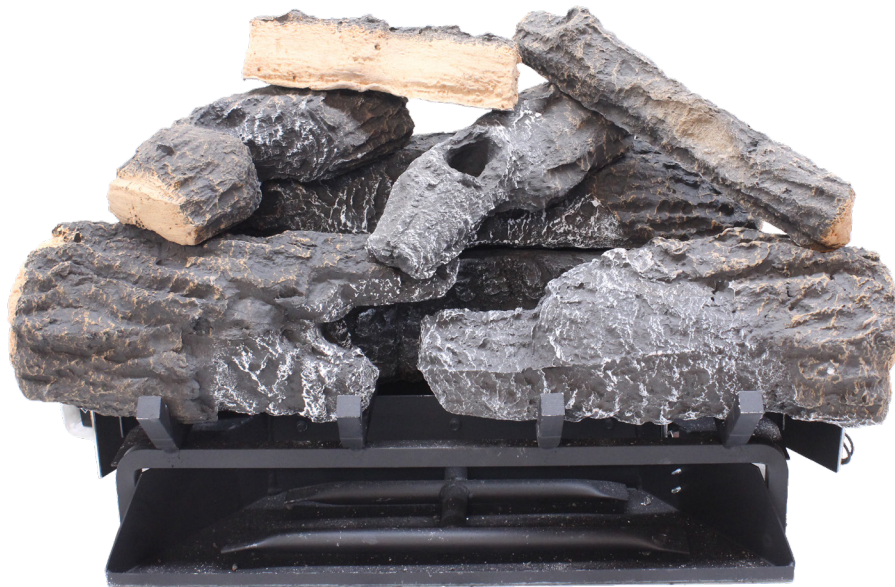
Front View of Stealth Burner with Full Log Stack