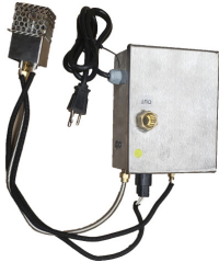
Hot Surface Ignition

Drop-In Style Burners - are available in a 22" diameter as a kit that includes the burner, valve, fittings, and connectors. Burner comes with orifices for Natural Gas and Liquid Propane. Available as match light only.