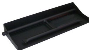
Glass H Burner