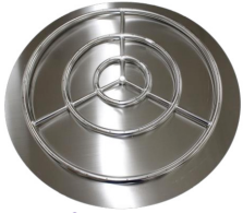
Fire Ring Burner

Fire Ring Burners - are available in 18", 24", 30" and 36" diameters. The listed size is the diameter of the base plate where the burner media is placed. Offered as a burner only or as a kit that includes the burner, valve, fittings, connectors and volcanic rock. Burner comes with orifices for Natural Gas and Liquid Propane. Available as match light only.